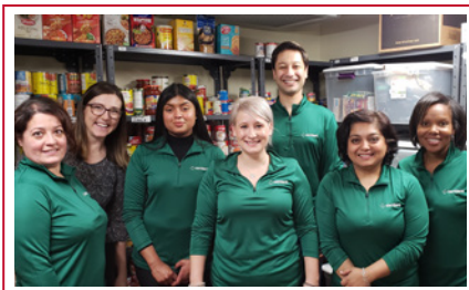
Sentient HR Services