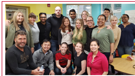
RBC Queen's Quay