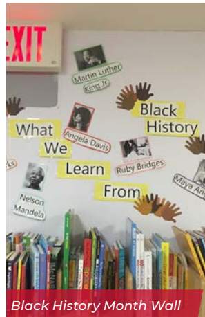
Black History Month Wall