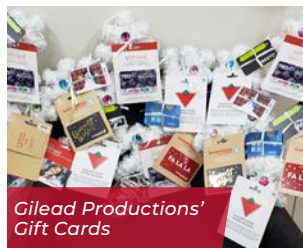
Gilead Productions' Gift Cards