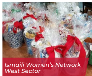
Ismaili Women's Network West Sector