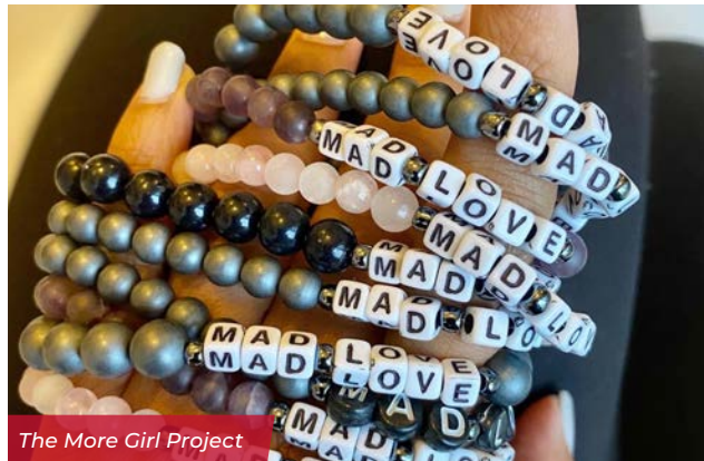
The More Girl Project