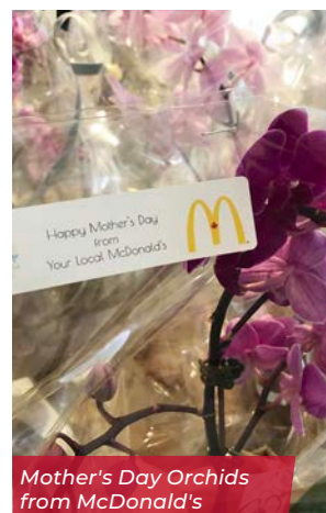
Mother's Day Orchids from McDonald's