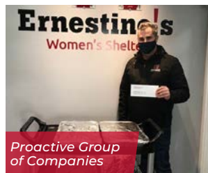
Proactive Group of Companies