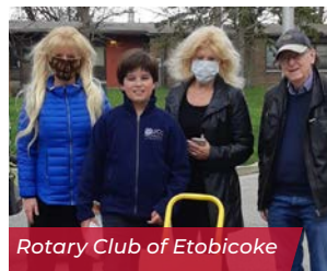
Rotary Club of Etobicoke