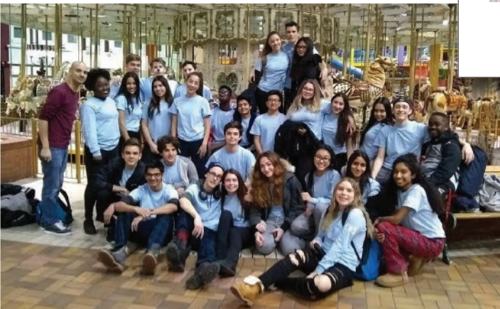
Volunteers from the Michael Power Community Outreach Program