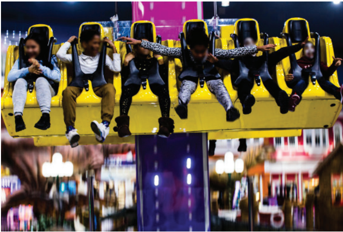
Children enjoying Winterfest

Our annual Winterfest holiday party was once again a phenomenal success! During the holidays, our generous community supporters donated gifts to the families, and we distributed these gifts to them during the week of our Winterfest celebrations. These gifts provided a lot of hope and joy to our moms and kids. This event was only made possible thanks to the generosity of Woodbine Mall and Woodbine Entertainment Group, who provided us with the space, volunteer support, and delicious treats. We are also incredibly grateful to the student volunteers from the Michael Power Community Outreach program, who accompanied the children on rides and made sure that moms had the opportunity to have fun and visit with old friends.