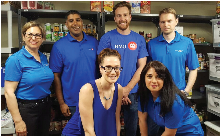
Bank of Montreal Volunteers

In 2017/2018, we had a phenomenal year of volunteer engagement. We had 30 groups and 492 individuals, who together contributed 4,611 hours of people power. Our volunteers share with us their talents and expertise in a variety of ways, and our shelter programs and services, as well as at our community engagement events, would not be possible without the help of our volunteers every year.