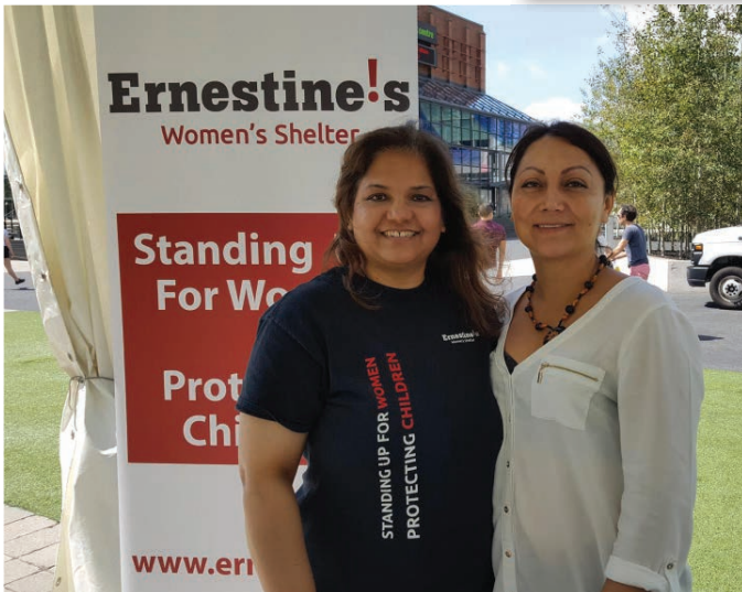
Can. You. Read. Festival