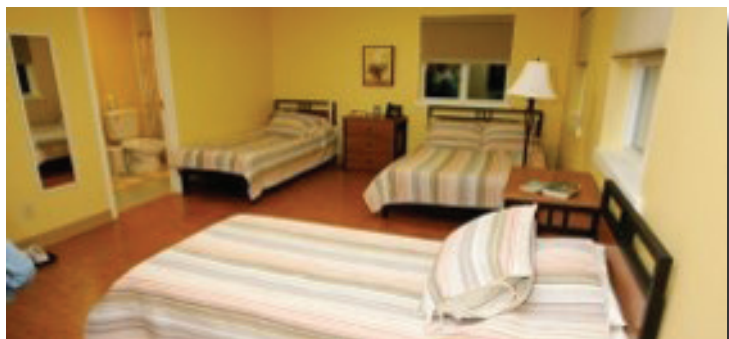
A typical room for a family at the shelter