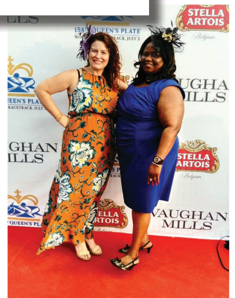
Queen's Plate, Woodbine Racetrack