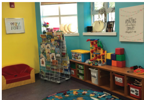
Child and Youth Playroom