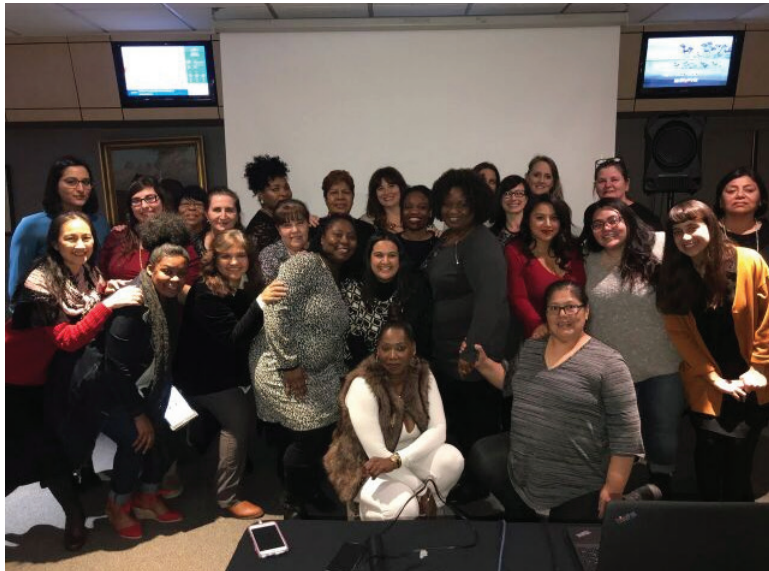
Ernestine's Staff at 2017 Holiday Celebration