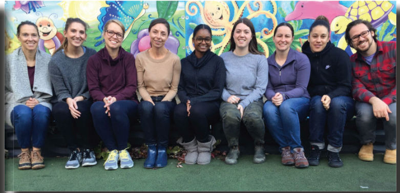
Johnson and Johnson Volunteers