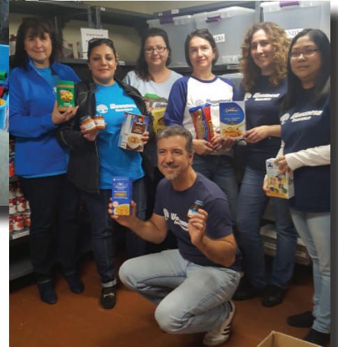
Wawanesa Insurance Volunteers