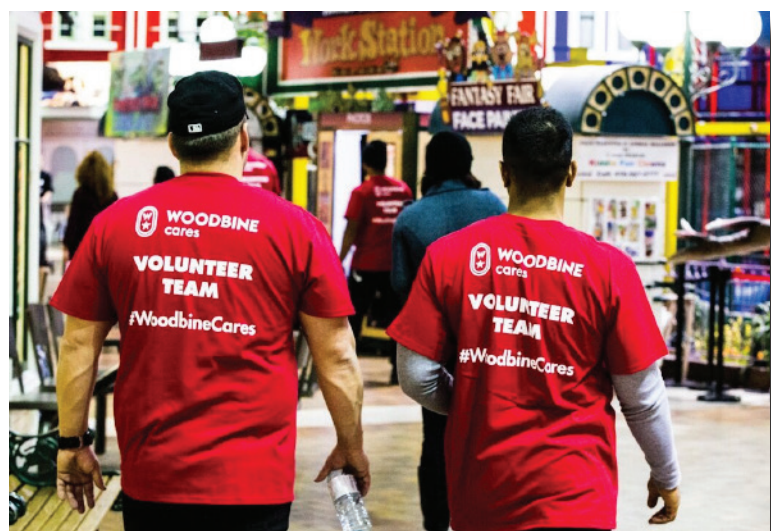
Woodbine Entertainment Group - Winterfest Volunteers