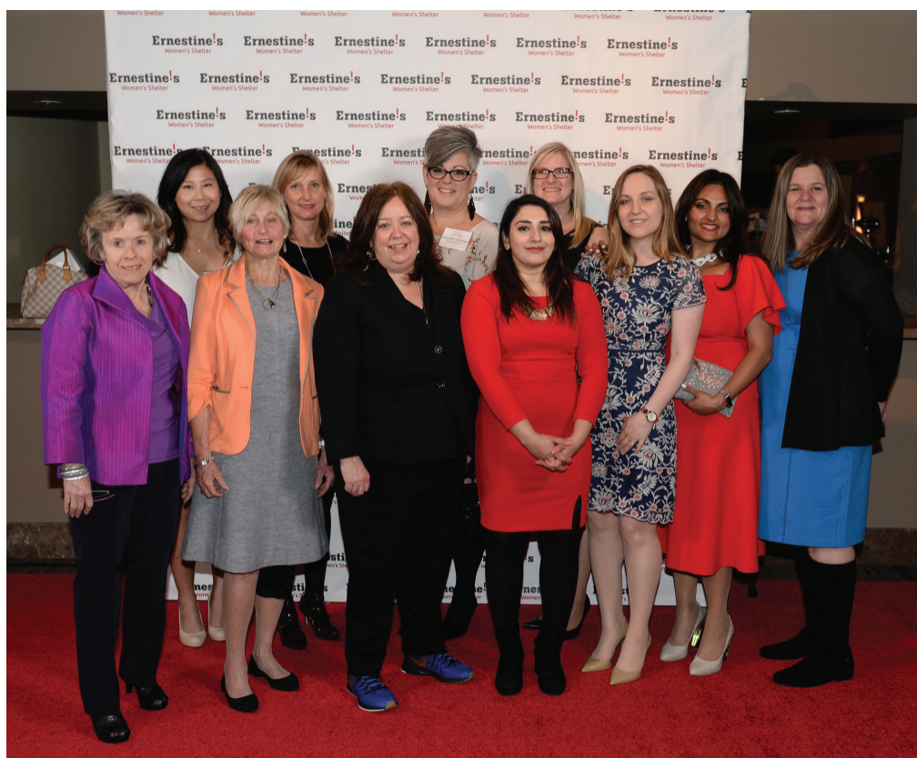
Ernestine's Women's Shelter's past and present Board Members at the 2017 Ernestine Affair