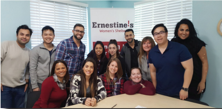
Woodbine Entertainment Group Volunteers