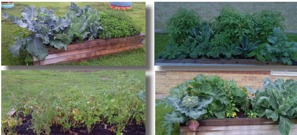
A variety of vegetables being grown in Elmlea Junior School's Learning Garden