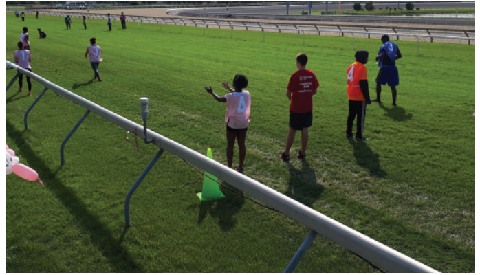
The Ernestine's Volunteer Team supporting the United Way at the Annual Turf Race