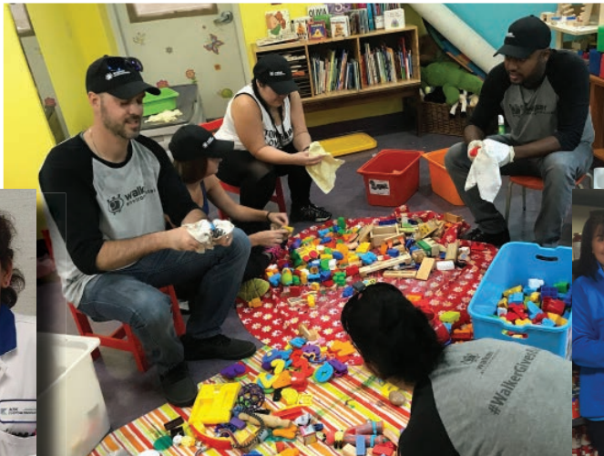
Walker Industries Volunteers