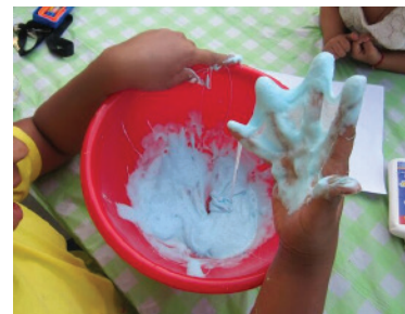
The children at Ernestine's enjoying summer camp activities, thanks to Rotary Etobicoke

Rotary Etobicoke has been supporting Ernestine's families for many years. They have donated items to our food bank, provided our children with back-to-school backpacks, and for the last two summers, they have funded our summer camp program for the children and youth. Thanks to the support from Rotary Etobicoke, 21 children and youth at Ernestine's were able to have a camp experience this past summer. The support from Rotary Etobicoke allowed these children an opportunity to heal from violence, which every child needs and deserves.