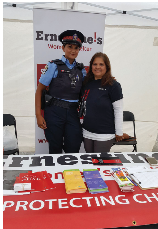
Ernestine's supporting Fusion of Taste