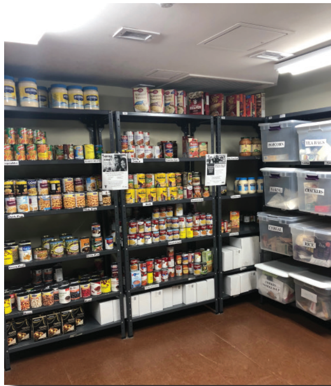
On-site food bank