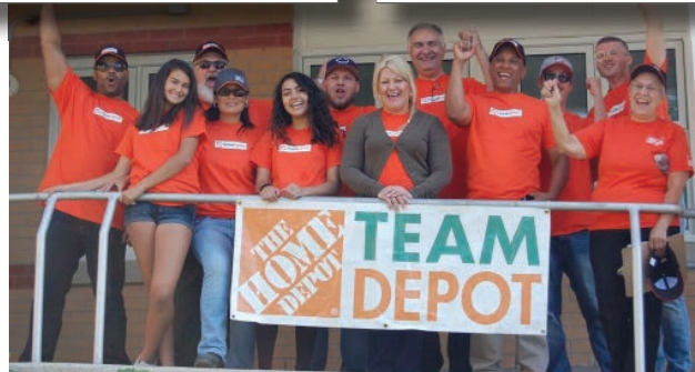
Home Depot Volunteer Group at Back-to-School BBQ