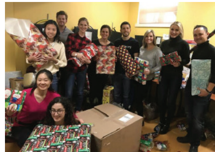
Google Canada Volunteer Team