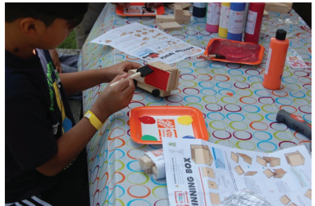
Children enjoying activities facilitated by Home Depot