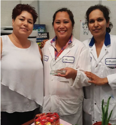
KIK Custom Products Volunteers