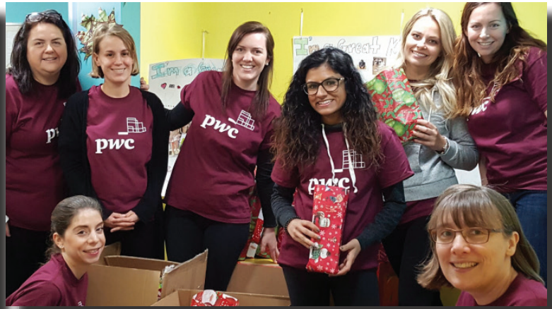
PwC, Canada Volunteers