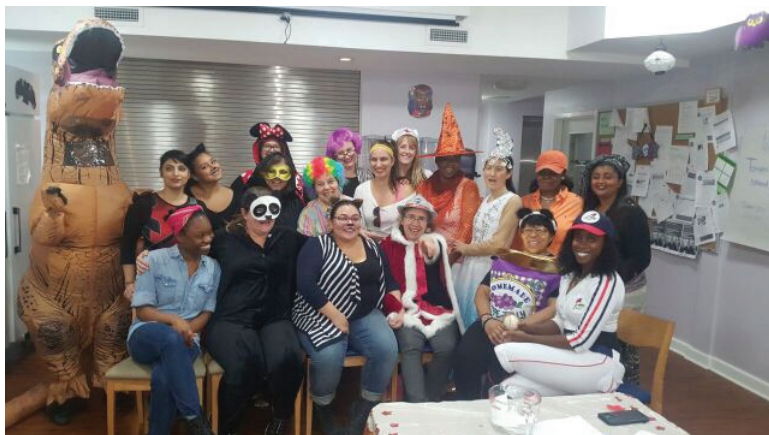
Ernestine's Staff at 2017 Halloween Celebration