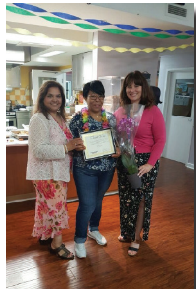
Celebrating our Volunteers at the Volunteer Appreciation Dinner