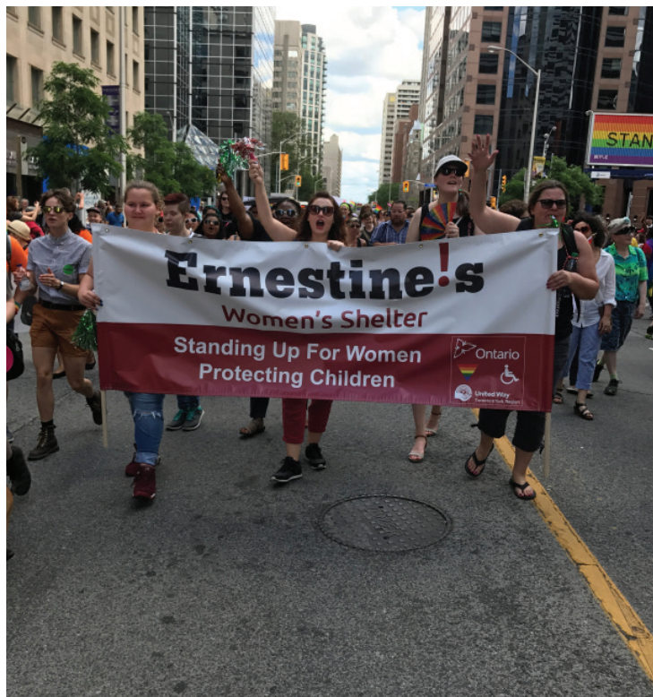
Ernestine's at Toronto Pride's 2017 Dyke March

As part of our commitment to supporting our community, Ernestine's staff, volunteers, and clients are proud to be part of various community-oriented events in Etobicoke and across the Greater Toronto Area. We are invested in community activism, as well as building relationships with agencies and diverse groups to enhance our excellent service delivery to women, youth, and children.