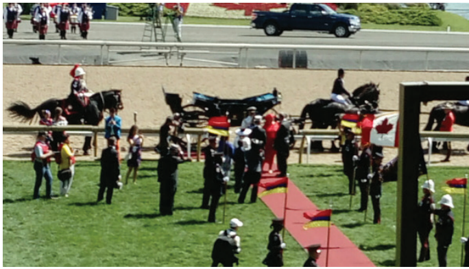
The Governor General arriving at the 2017 Queen's Plate, Woodbine Racetrack